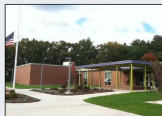
East Granby Middle School