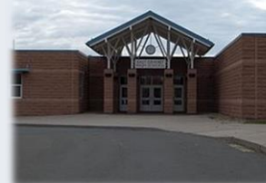
Carl D. Allgrove Elementary