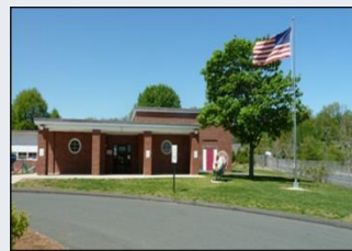
R.D. Seymour Elementary School